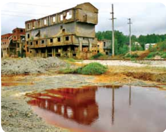
AMD, acidic water rich in heavy metals, poses a potential risk to waterways and aquatic life.

being used to dewater a variety of micro-solids beyond algae. While many customers utilize the SLS for dewatering microalgae, others have found the system effective for dewatering a range of different foods and other materials. As an increasing number of SLS Lab Model systems are placed into the hands of research institutions and universities, the documented portfolio of materials able to be dewatered on the machine is continually increasing.